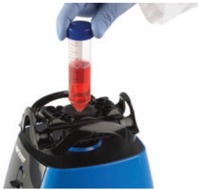
Center pad area for hand held mixing