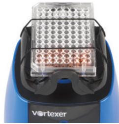
Assay plate x 1 (to be used with retention cords)