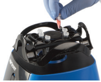
0.5 mL microfuge tubes x 6 (vertically mounted)