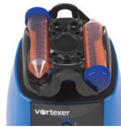
50 mL conical tubes x 2 (horizontally mounted)