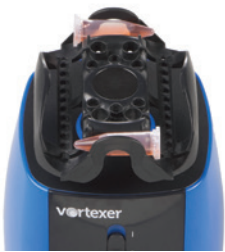
5 mL tubes x 2 (horizontally mounted in the same retention space as 15 mL)