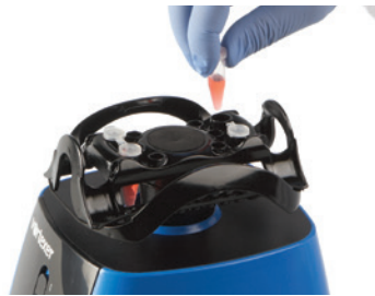
1.5/2 mL microfuge tubes x 4 (vertically mounted)