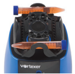
15 mL conical tubes x 2 (horizontally mounted)